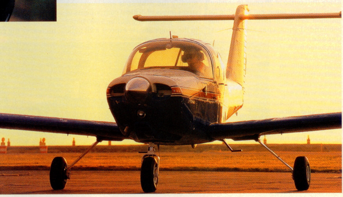
The Tomahawk's double doors and bubble view give pilot and passenger a wide-screen outlook on the passing scenery, making the aircraft perfect for weekend getaways.

Just fewer than 2,500 Tomahawks were produced in model years 1978 to 1980, with the most units produced from 1978 to 1979. Aftermarket kits for the rear wing spar, vertical fin attach plate, and rudder hinge were developed to address several airworthiness directives (ADs) that were issued soon after these models hit the ramp. In 1981 and 1982, the Tomahawk and Tomahawk II were made with many of the ADs taken care of at the factory. These later models are preferable, as the installation of AD kits in the field was accomplished with varying degrees of accuracy. Aircraft with these field ADs may exhibit divergent flight characteristics from the standard Tomahawk because of what are considered vague installation instructions from Piper, according to several A&Ps we spoke to. Of course, as the gods of economics would deviously demand, fewer of the later models were produced as steeply rising interest rates and a soft economy helped send new aircraft sales to the basement in the early 1980s. Annual production runs during 1980 to 1982 were less than 200 aircraft a year-not even one-quarter the yearly production of Tomahawks in 1978 and 1979. It's no surprise that prices steadily increase with model